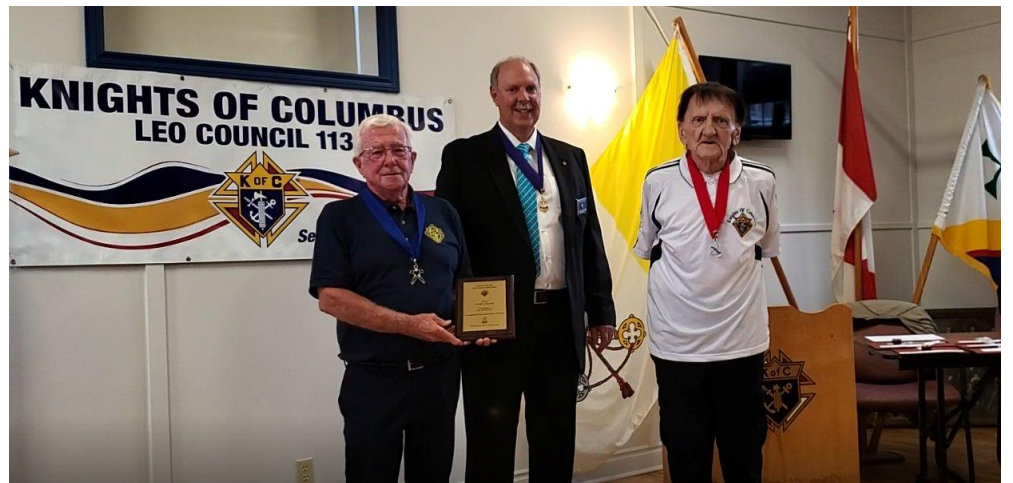
Award Winners along with Council Members